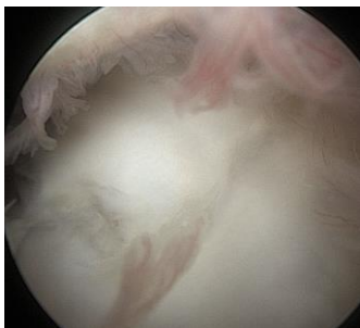
Osteochondral lesion L Hock